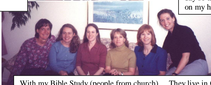
With my Bible Study (people from church)... They live in Charlotte (where my church is). They live kind of far away so they were mostly spared listening to me whine about my foot, but they came to Waxhaw so I wouldn't have to drive to Charlotte with my hurt foot.