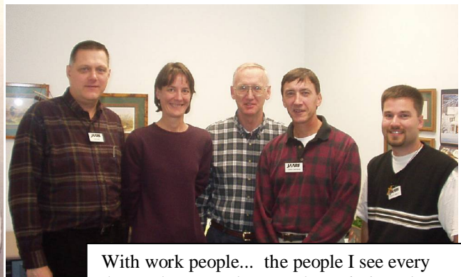
With work people... the people I see every day so these people got to hear daily updates on my hurt foot saga...