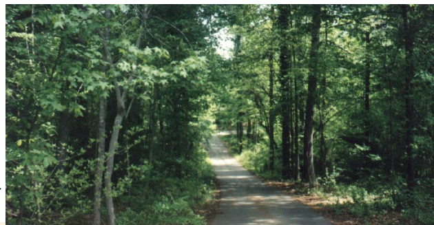
My cool driveway (from the road)... notice how you can't see the house from the road... I love that feature...