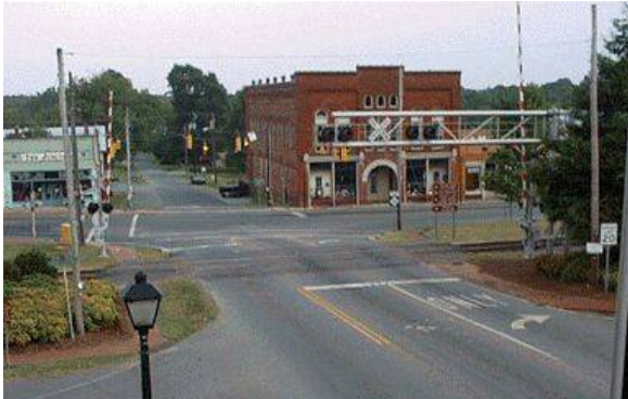
Downtown Waxhaw... This is our traffic light – we just only have the one...