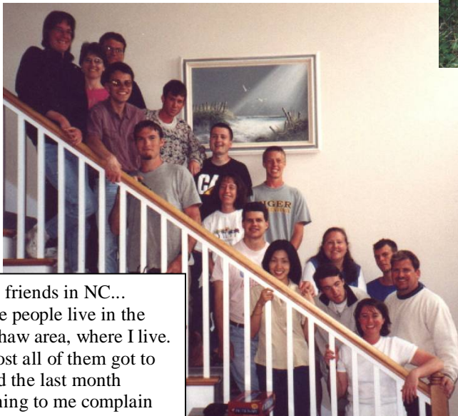
With friends in NC... These people live in the Waxhaw area, where I live. Almost all of them got to spend the last month listening to me complain about my foot*...