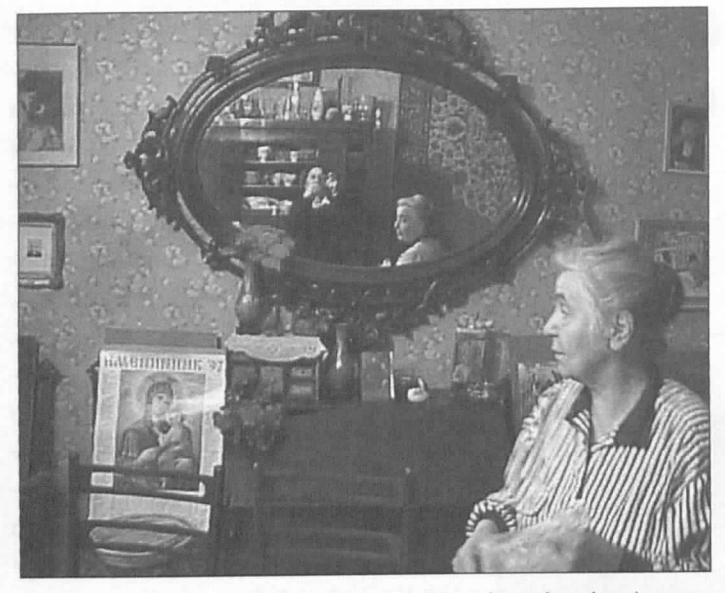
Olga Ladyzhenskaya (with Tamara Rozhkovskaya in mirror)