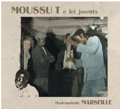
« Mademoiselle Marseille » New release 05.2005

With their mixture of black and traditional Occitan music, Moussu T e lei Jovents invent the song of Marseilles anew to spread the message of Provence, a harbour turned towards the sea, cosmopolitan and proud of its history.