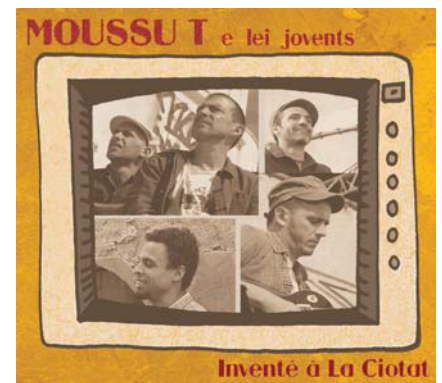
DVD+CD « Inventé à La Ciotat » New release 11.2007 DualDisc