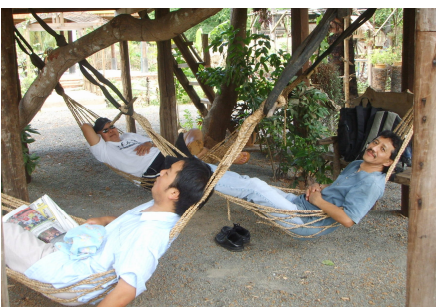
Hammock heaven in a Cambodia home- stay