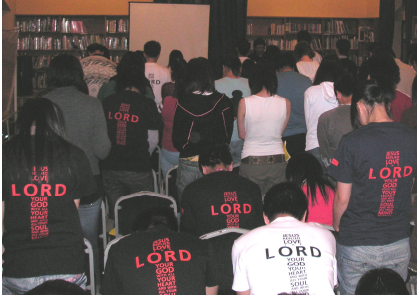
Youth at Midlands Easter Conference with camp T-shirts

This was an exciting month (every month is exciting when the Lord is in it). I was given another opportunity (I spoke there also last year) to speak at the Midlands Easter Conference (a combined Chinese Church event with people from places like Birmingham,