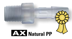
AX Natural PP