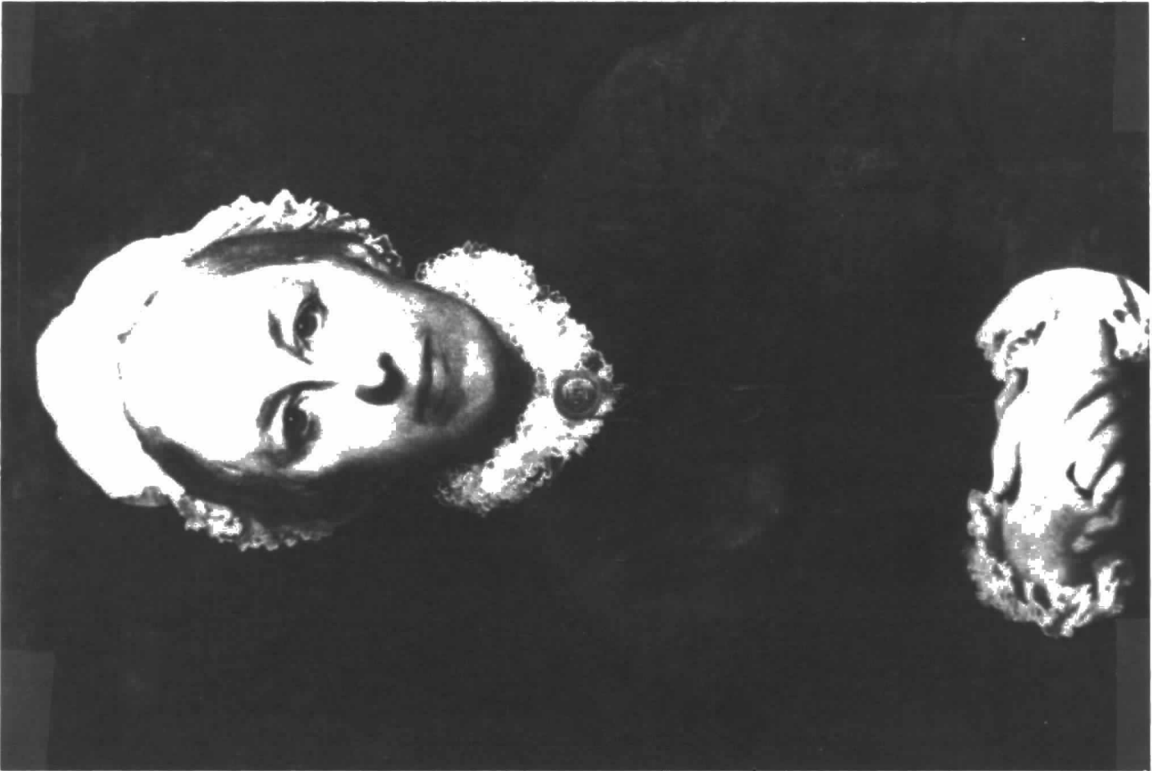
Emily Davies, founder of Girton College