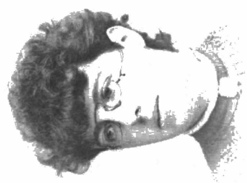
Charlotte Angus Scott in the 1890's